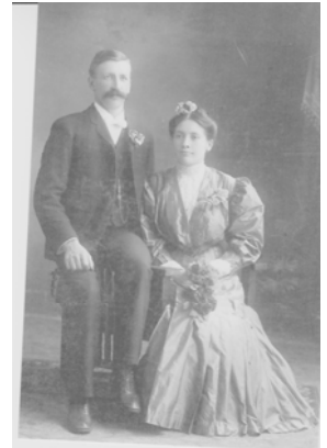
Wedding picture 1905