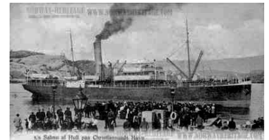
SS Salmo, Wilson Line