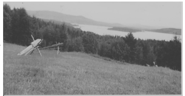
Overlook over Vallåsen, Ramsele, Sweden