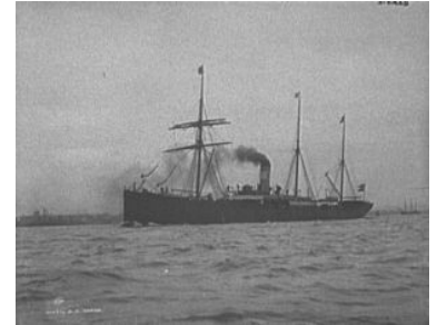
SS Norge sank off Rockall in 1904