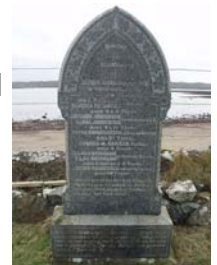
SS Norge Memorial