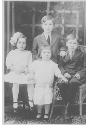
The Pearson's children