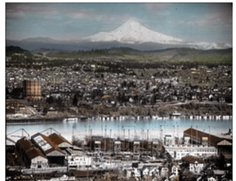
Portland early 1900