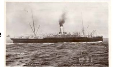
SS Canada, White Star-Dominion Line