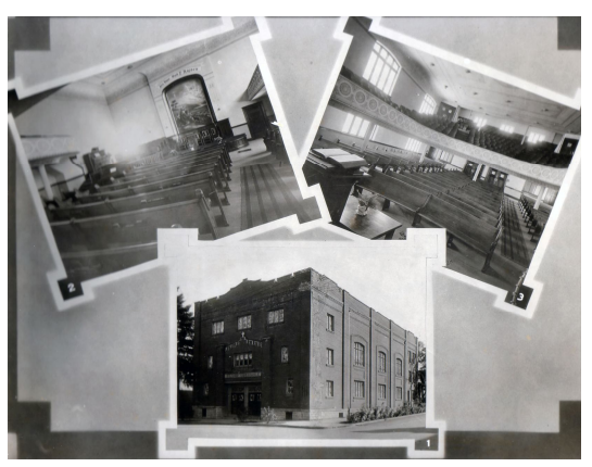
Portland Tabernacle Church ca 1930

For over 40 years it was the religious and social center of Portland's humble and devout Swedish Mission Covenant congregation. This building, now listed in the National Register of Historic Places, was dedicated by the Swedish Evangelical Mission Covenant Church of Portland on February 18, 1912. The auditorium features a U-shaped