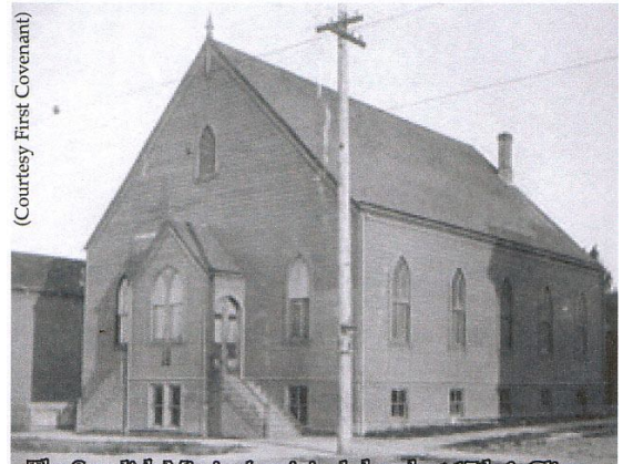
The Swedish Mission's original church at 17th & Glisan

They didn't know that the American had a church of like faith in Portland."