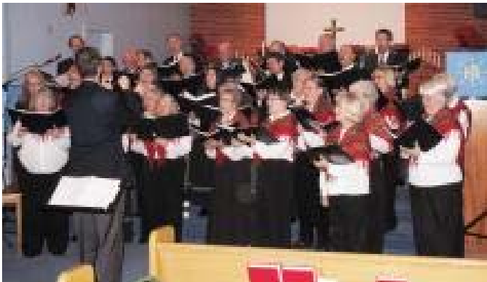
Scandinavian Men's Chorus and Ladies Chorus singing; Lyssna, Lyssna; Jul Strålande Jul, Gläns över sjö och strand.