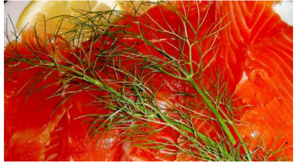
Gravlax with dill