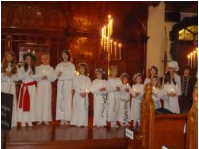
The Swedish school in Portland