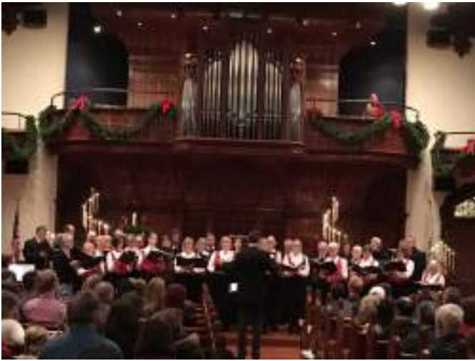
Portland Scandinavian Chorus