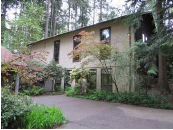
West Hills Unitarian Church