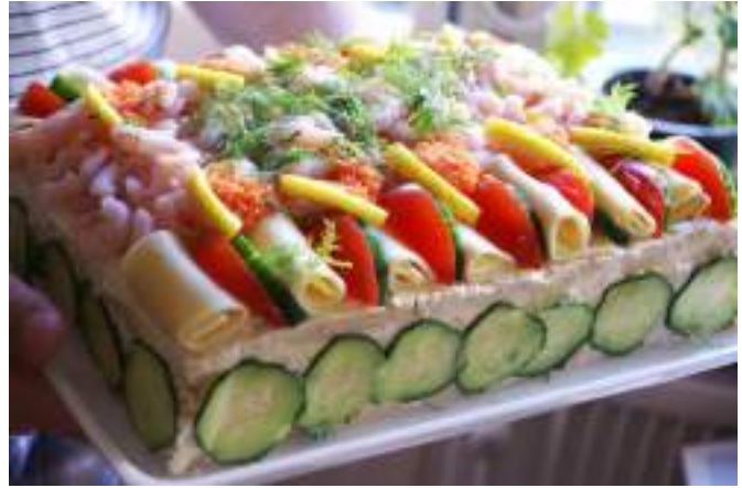
Smörgåstårta to be served at the event