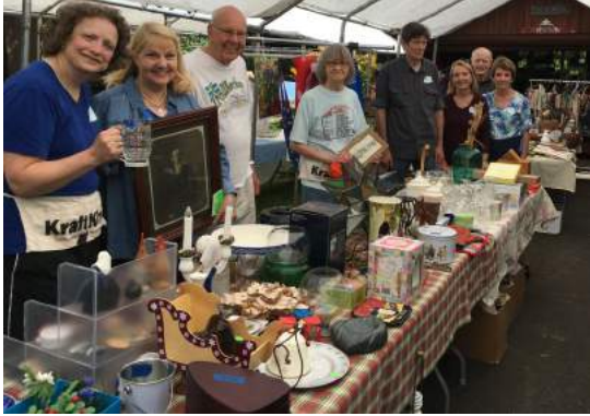
Fogelbo yard sale set-up crew