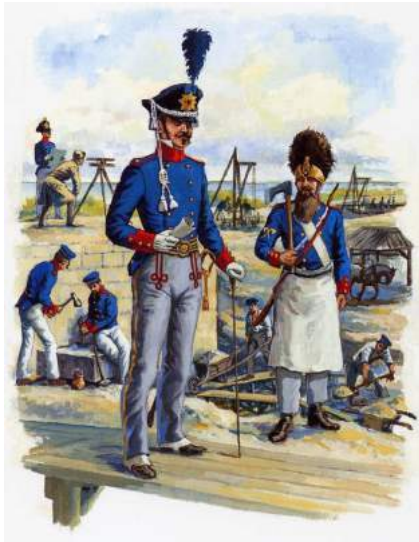
Digging Göta Kanal